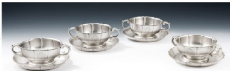
Fig 6 above: A set of silver fruit bowls. With Mary Cooke.