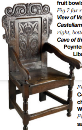
Fig 9 left: A North Country oak wainscot chair from about 1680. With Peter Bunting.