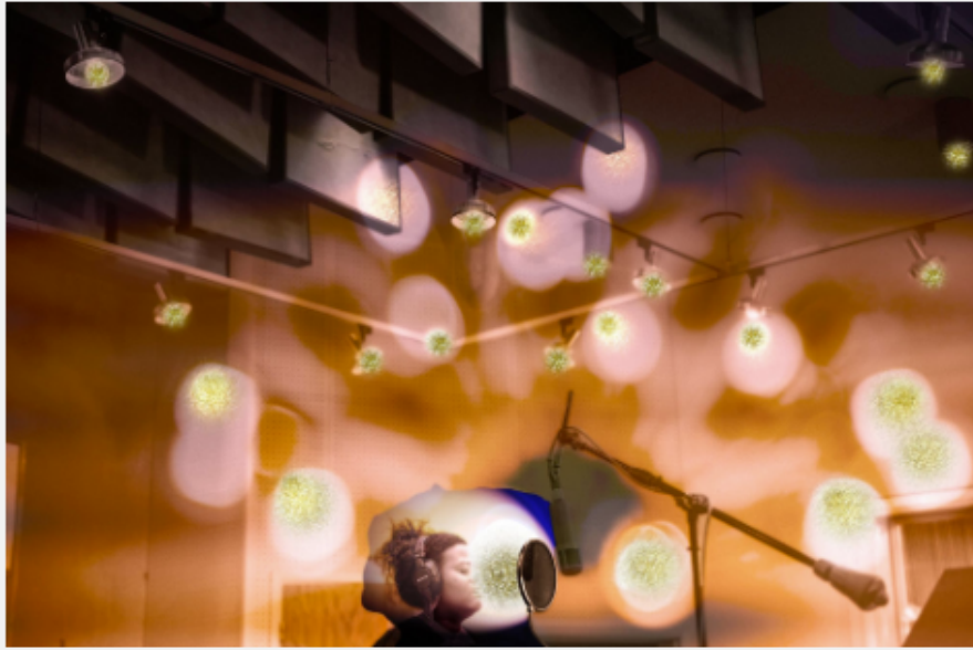
Sonia Boyce Sofa 2021 Digital pigment print with glitter Edition of 5 + 1 AP 40 x 40 cm / 23 5/8 x 15 3/4 in