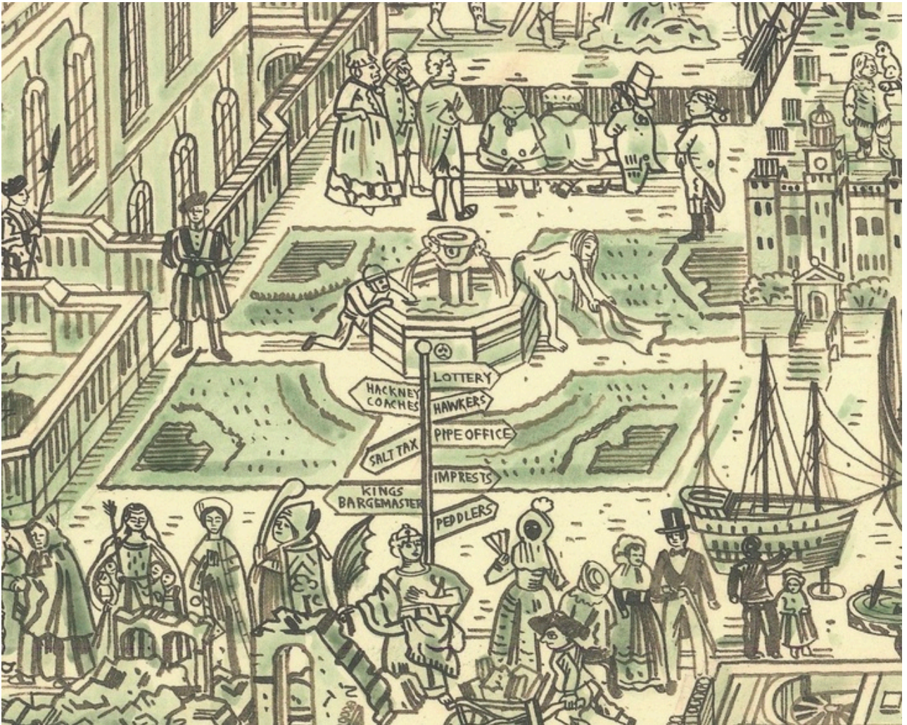
Image the footfall at Somerset House if it had a real fountain of youth

Somerset House is dense with secret histories — too many to mention here. The figures who've worked and passed through here have made waves across the globe. That's why I'm providing a handy key for viewers when they come and see it at the TAG Fine Arts stand at the London Original Print Fair — in the very building where all this incredible stuff took place.