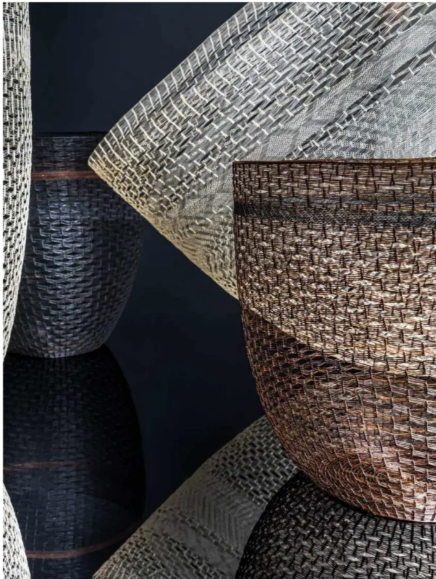
Selection of works by Dabye Joong at London Craft Week 2022.