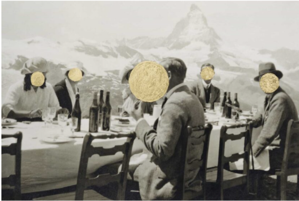
Photo by Carolle Benitah Dejeuner Mont Blan, 2018 at Alessia Paladini Gallery / Photo London

'The leading art fair for celebrating the past, present, and future of photography', Photo London returns to Somerset House for 2024. The fair presents historic and vintage works from the world's leading photography dealers, while also spotlighting emerging galleries in the Discovery section, and the fresh perspectives that come with them. Each edition also puts on a Public Programme, which includes special exhibitions and installations as well as an awards programme headlined by the Photo London Master of Photography Award .